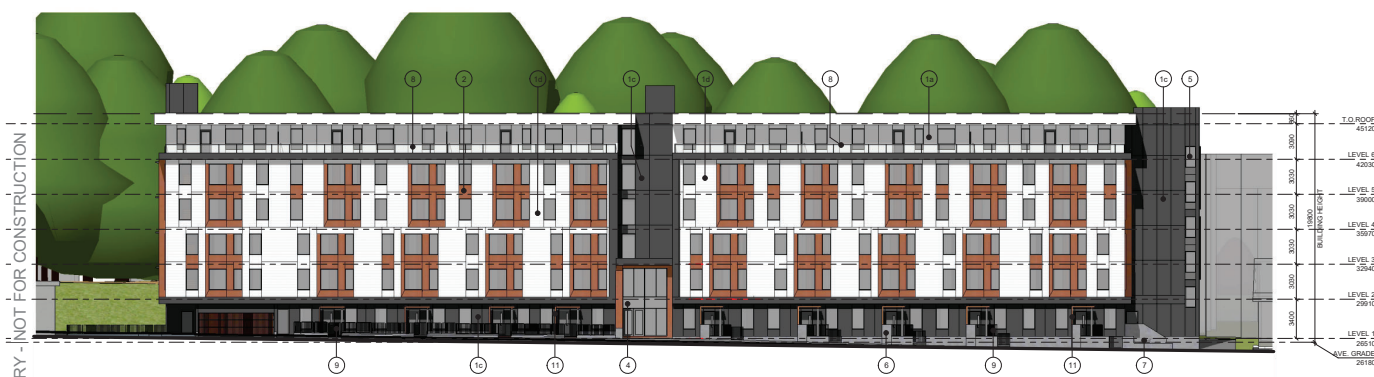
3 DP107 EAST ELEVATION DP112 1:200