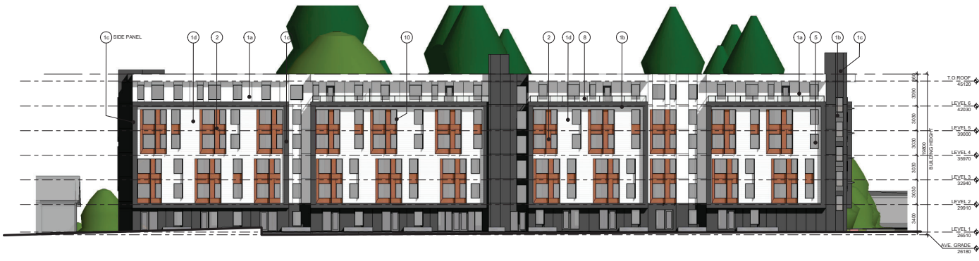
4 DP107 WEST ELEVATION DP112 1:200